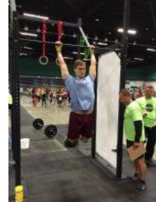
War of the WODs

Like Our Facebook Page to Stay Updated on Games News